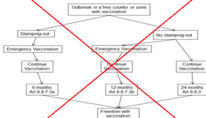
Fig. 2. Schematic representation of the minimum waiting periods and pathways for recovery of FMD free status after an outbreak of FMD in a previously free country or zone where vaccination is practised

Waiting periods are minima depending upon outcome of surveillance specified in respective articles. If there are multiple waiting periods because of different control measures, the longest applies.